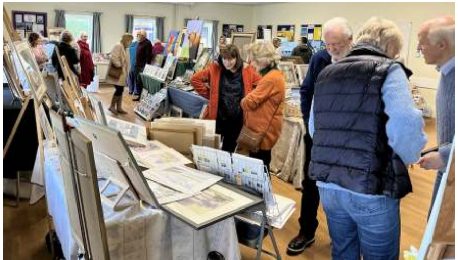
Easter Saturday at the Lechlade Pavilion

Seventeen of us set up the Pavilion and were ready to receive our first visitors at 10 am. A steady stream kept the place buzzing and compliments came thick and fast. Several sales were made and cards proved very popular once more. Everyone kept saying that we have a high standard and lots of talent. I think they enjoyed the event as an exhibition. Hopefully they will come back for more for our real exhibition in August.