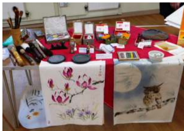
Some of Maggie's materials

Next Meeting Tuesday 9th April 2024, 2.00 - 4.00pm - Wildlife with Colour Pencils - Rachel Anders