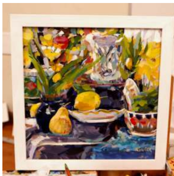
Gill's still life composition

See the LAS web site for a more detailed report.