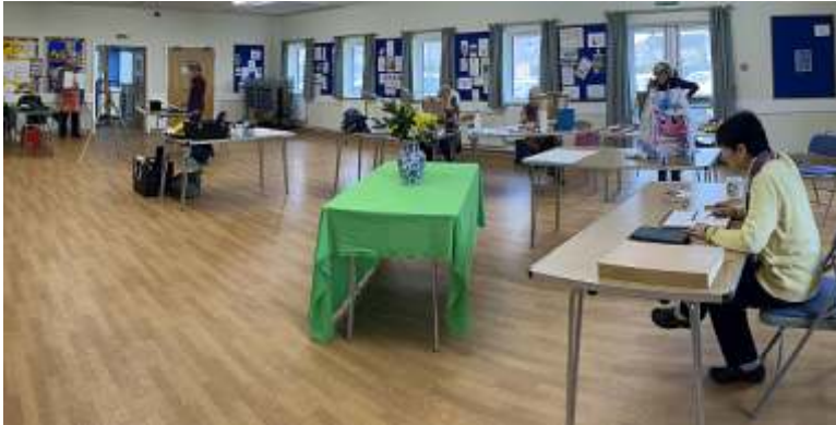
A 'pin drop' moment

An enthusiastic band of members hired the pavilion for the first ever in house workshop day. This was a workshop style day without a 'tutor' where we used the space to practice observational skills. Three still life groups were set and we all tried to be adventurous in our approach. Whilst the final results may not have been stunning the consensus was that it was a truly successful day and we all want more. You might consider joining the next one perhaps?