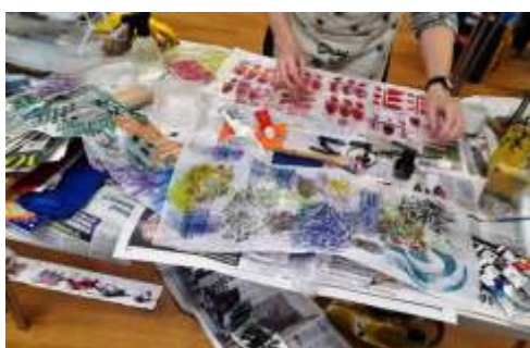
Sketch books in the making

After a tiring and satisfying day of work, all concertina sketchbooks were completed with confidence and thought. It was an excellent workshop once again. For more information and fabulous photographs go to the LAS web site.