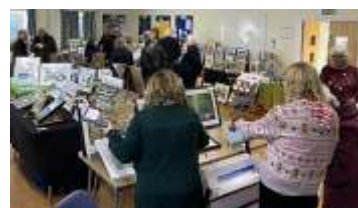
Pictures at the exhibition Pop Up Sale